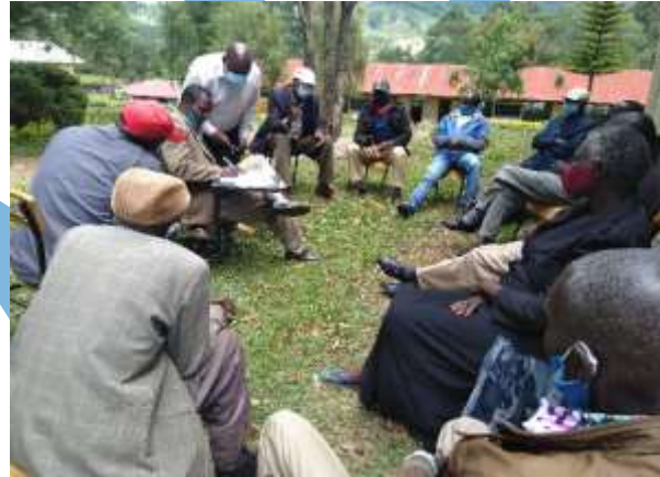
FOCUS GROUP DISCUSSION AT KAIBOS