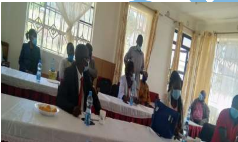
WEST POKOT MUNICIPALITY MAP